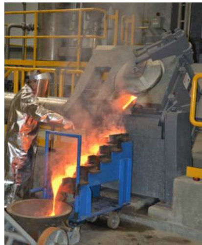
The Brucejack Mine pours its first gold bar in June of 2017. The mine is about 25 miles from the Alaska border.

“The goal is to get federal involvement in our transboundary mining issue,” he said.