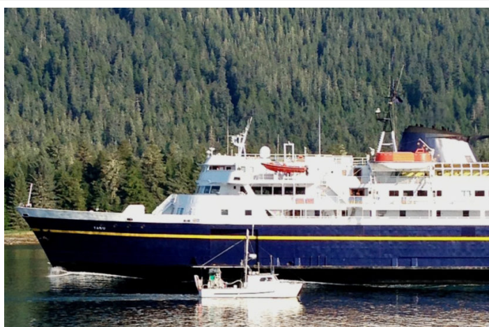
A Petersburg fishing boat passes the ferry Taku near the entrance of Wrangell Narrows in August, 2013. The ship was put on the market in 2017.